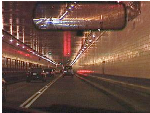
PKWY TNPKE TUNNEL / Trevor Morgan

Works by Morgan have been exhibited at the Centre for Contemporary Photography and SPAN Galleries in Melbourne Australia; Socrates Sculpture Park and TRANS Gallery Dumbo New York, and Space Force Galleries in Tokyo. www.trevormorgan.info , www.pixelartnyc.com