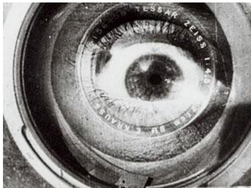
2008: Man with a Movie Camera / Perry Bard

Session: Bigger Picture Commission: 2008 - Man with a Movie Camera