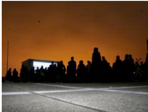
A Wall is a Screen