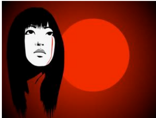
Flag Metamorphoses / KOREA - JAPAN, Flash animation by Nicola Tauscher, DE/KR 2006

Biography: The swiss / luxembourgish artist Myriam Thyes has studied at the Academy of Fine Arts in Dusseldorf, Germany, and the Cité Internationale des Arts, Paris. Since 1993, Thyes has participated in exhibitions and festivals. She has realised solo projects in public areas with flag installations in Dusseldorf (1996) and Luxembourg (1997). Thyes specialises in videoart, animation, digital imagery and media art projects on public screens. In 2005, her participatory animation project Flag Metamorphoses received funding from the Swiss Federal Office of Culture, and her video Ascension won the Depict! Award at the Encounters Shortfilm Festival in Bristol, UK. Flag Metamorphoses has been shown internationally and has received the Multimedia Prize 2006 at Avanca Festival, Portugal. www.thyes.com