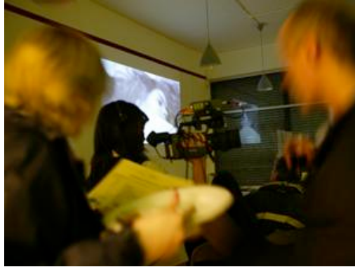
Let's Go Global / Let's Go Global