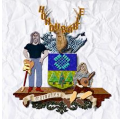
Honourable Ordinaries / Juneau Projects

nature in the 21st century. www.juneaurecords.co.uk