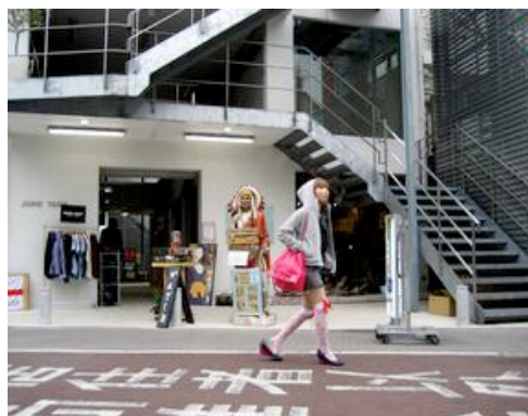
Street Image / 8GG

interactive art, and aleatory music amongst others. As these varied genres suggest, 8GG's work centres on improvisation and collaboration. In 2002, 8GG developed their own custom computer controlled system for the realtime manipulation of audio and visual material during their live performances. Recent developments of this system enable the control of a given installation or performance to be shared between the artists and the participants. The group have successfully exhibited and performed work in cities around the world in addition to VJ sets in clubs, also providing visual material for international theatrical productions. Their work has a clean, fresh approach which aims to be playful and fun. www.8gg.com , www.folly.co.uk