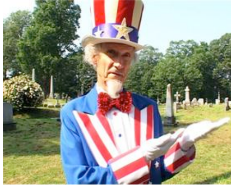
Portfolio Image / The Light Surgeons

www.thelightsurgeons.co.uk , www.avfolklore.blogspot.com